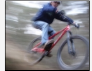
DMR Sidekick 2 com..