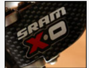
SRAM X0 Review