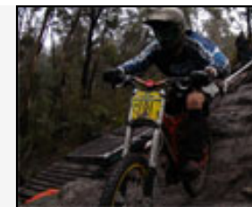
2005 NSW State Rou..

All content copyright 2003-2004 The Farkin Crew . All rights reserved. No reproduction allowed without written permission. Farkin is a registered trademark of Rotorburn. ABN: 38 951 849 043