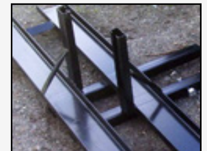
Gripsport Dual Bik..